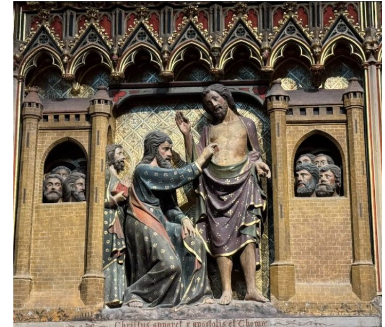
South wall of the choir enclosure, Notre Dame de Paris Jean Ravy then Jean le Bouteiller, architects sculpture, first half of 13th century; polychromy c. 1860 April 11, 2025