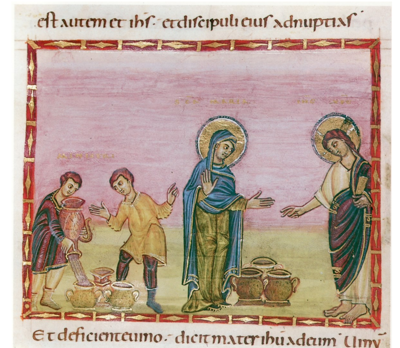
"Wedding at Cana," from Codex Egberti, c.980, Manuscript, Stadtbibliothek, Trier