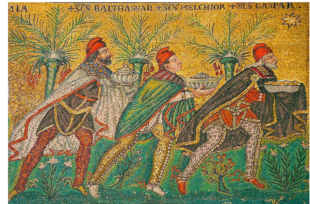
"The Three Visiting Magi", Byzantine wall mosaic, c. 526 CE Basilica of Sant'Apollinare Nuovo, Ravenna, Italy