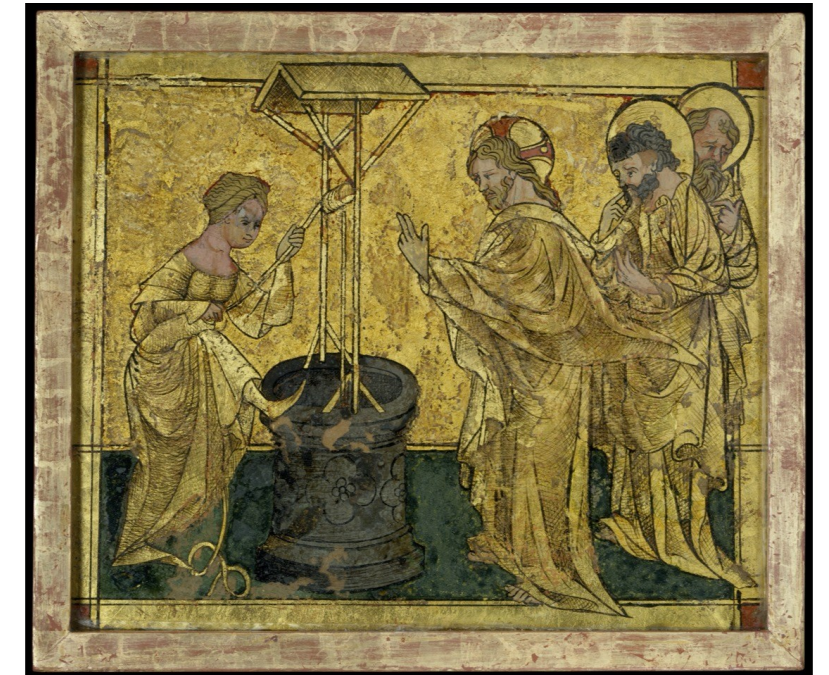
Jesus and the Samaritan Woman at the Well, c. 1420, SW German, gold leaf, paint and etching on glass